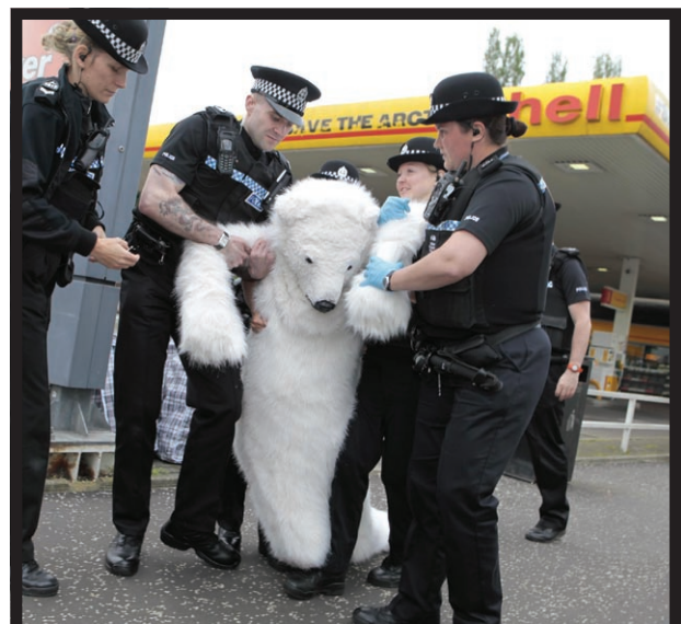
Polar bear arrested during Edinburgh Arctic protest

http://earthjustice.org/about/clients_coalitions/reoil