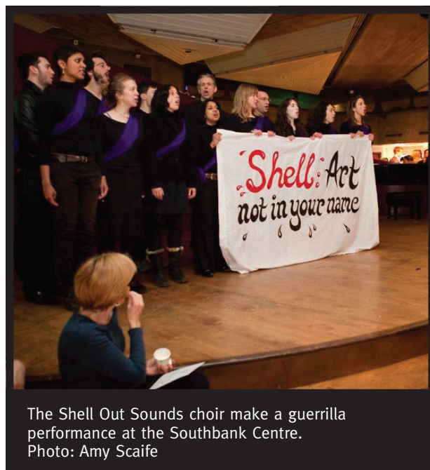
The Shell Out Sounds choir make a guerrilla performance at the Southbank Centre.

The briefing is also timed to coincide with the international Meltdown Festival taking place in June 2013 at the Southbank Centre in London. Every year, an artist of international repute curates the festival, and in 2013 that artist is Yoko Ono. Apart from an illustrious career spanning performance art,