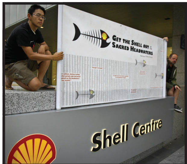
Banner with 60,000 signatures against Shell’s Sacred Headwaters development.