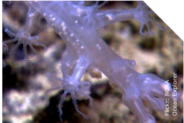
Flickr: NOAA Ocean Explorer

A separate team found that fish populations declined dramatically on these same two reefs in the aftermath of the spill. 85