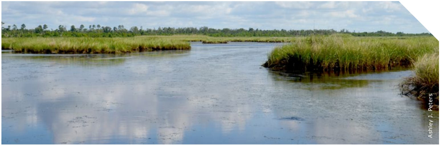
Ashley J. Peters

in the deep water may have increased the retention of oil in the water column. 14 While there is evidence that microbes living in the deep Gulf quickly began breaking down the methane and propane gases trapped within the huge plumes, the fate of much of the oil has until recently been uncertain. 15,16